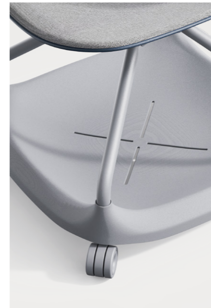
Book Bag Rack

Keeps book bags secure while providing foot support.