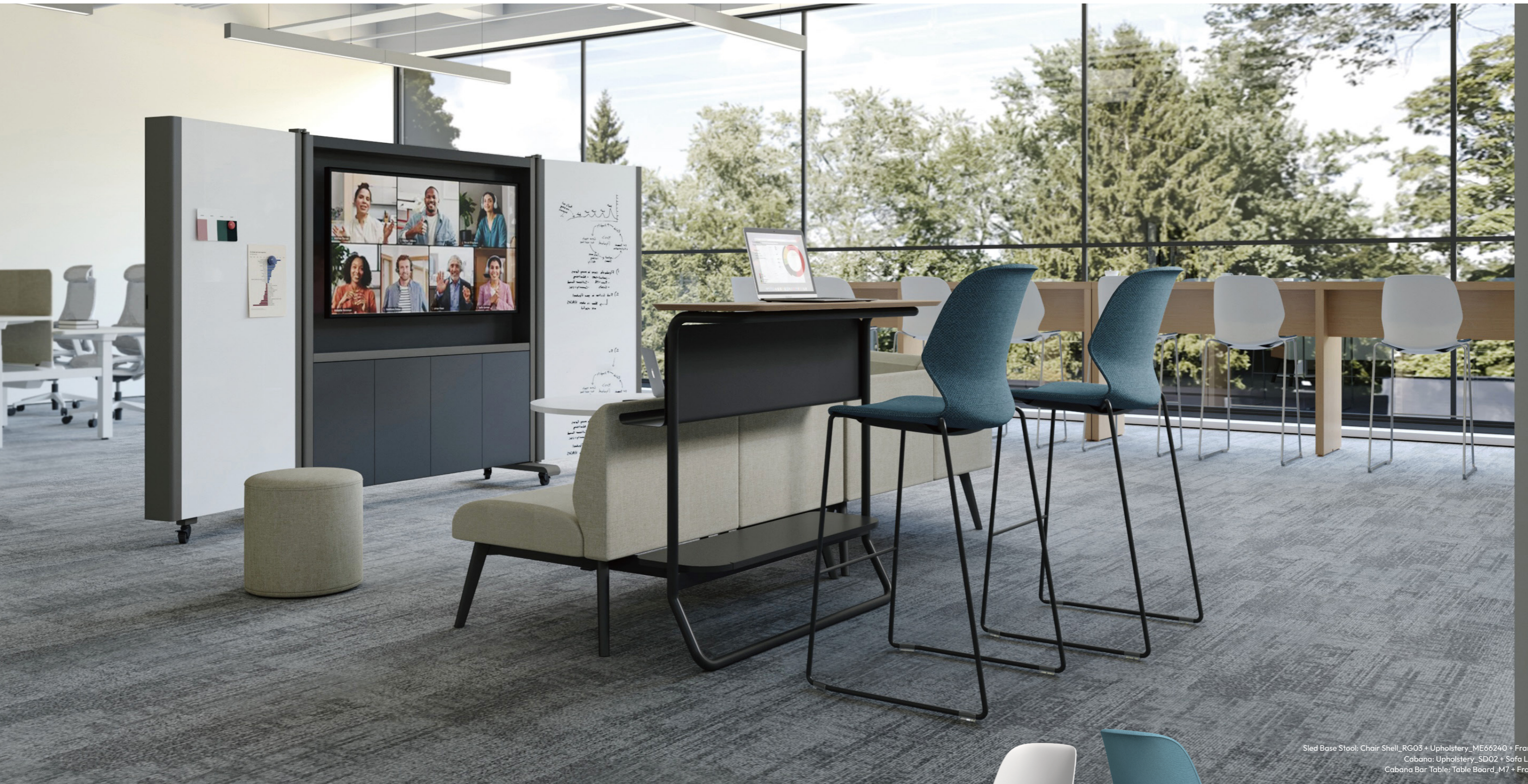
Sled Base Stool: Chair Shell_RG03 + Upholstery_ME66240 + Frame_K43 Cabana: Upholstery_SD02 + Sofa Legs_K17 Cabana Bar Table: Table Board_M7 + Frame_K17

Different forms converge, diverse postures coexist in perfect balance. Sofas, bar stools, low stools and side tables can be freely configured, accommodating both intimate group discussions and casual standing conversations. The seating collection comes in three options: non-upholstered, seat-upholstered, and fully upholstered. Non-upholstered features a minimalist open aesthetic; seat-upholstered delivers resilient ergonomic support; fully upholstered offers soft enveloping comfort. Select freely according to your spatial style and practical usage needs.