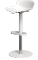
Bar Stool (Adjustable)