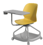
Bookbag Rack with Worksurface