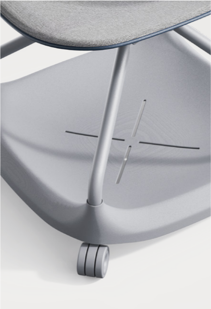
Book Bag Rack

Keeps book bags secure while providing foot support.