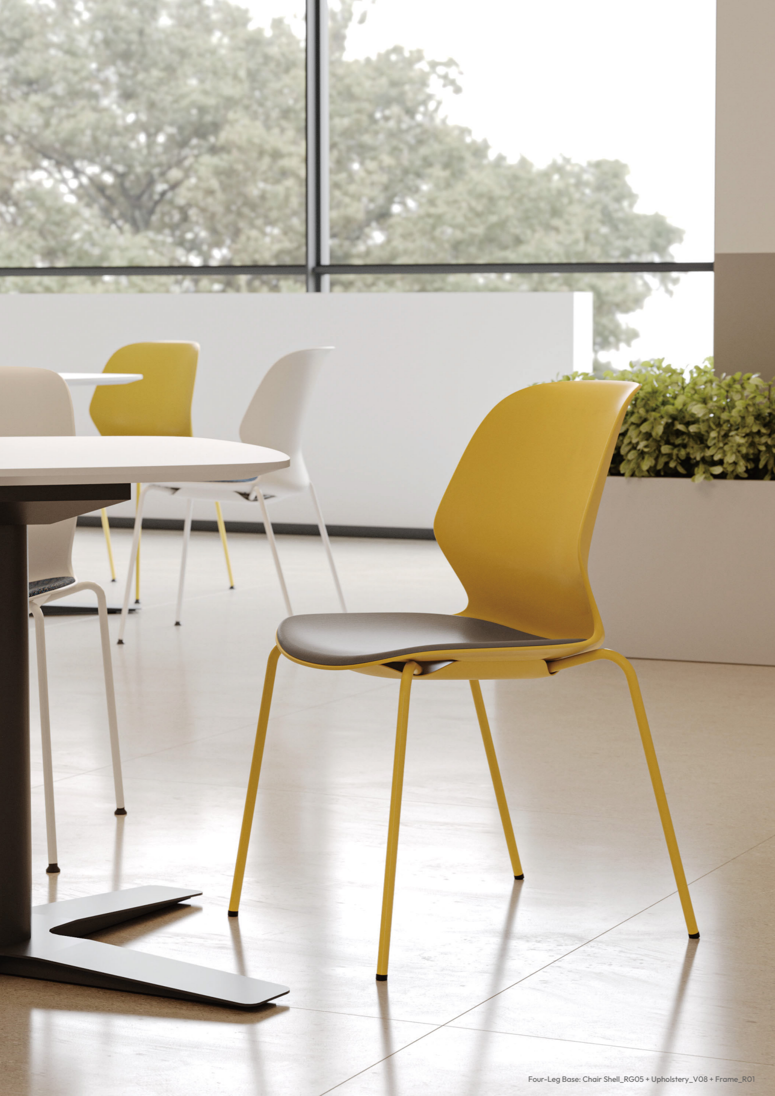
Four-Leg Base: Chair Shell_RG05 + Upholstery_V08 + Frame_R01