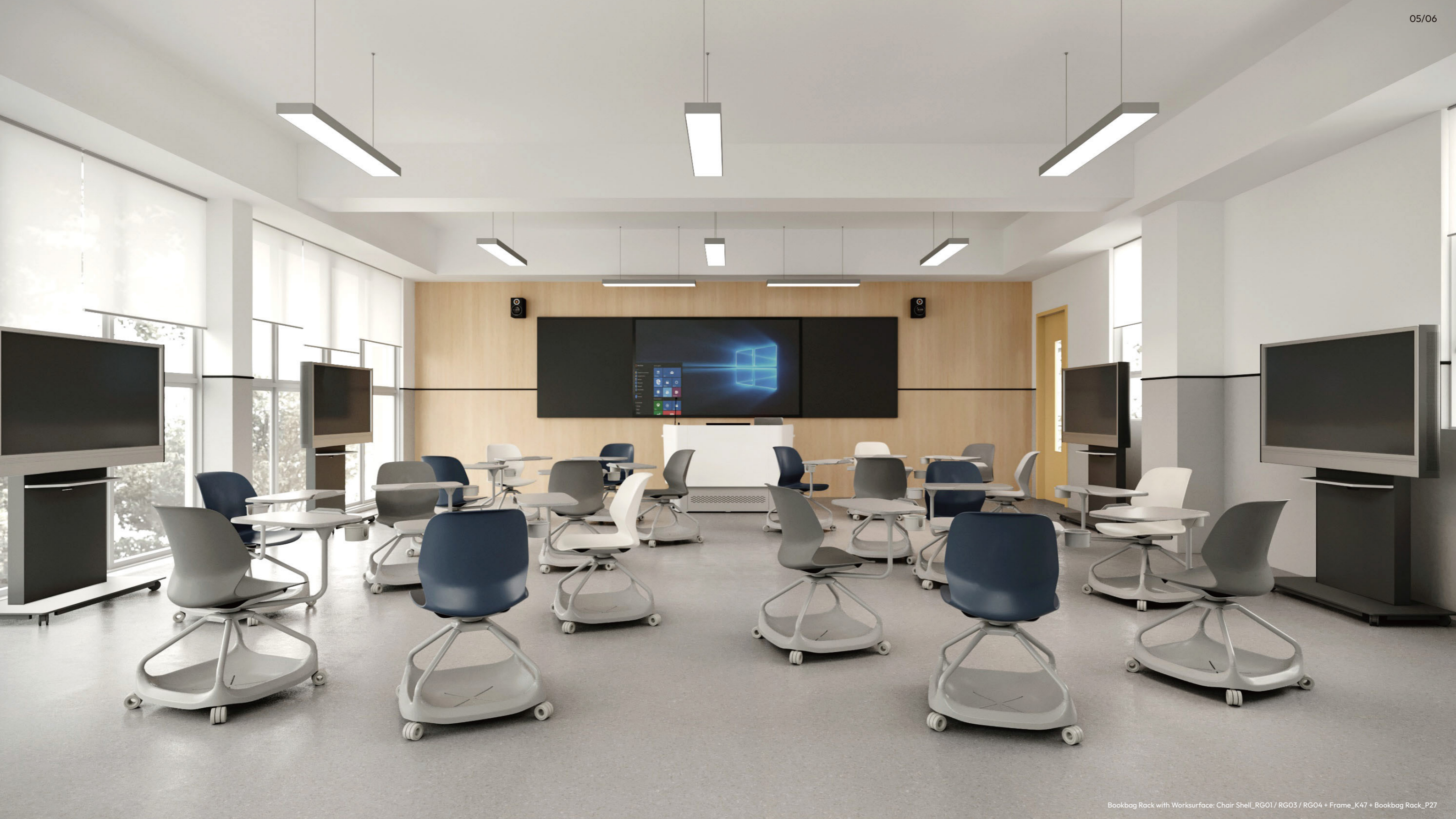
Bookbag Rack with Worksurface: Chair Shell_RG01 / RG03 / RG04 + Frame_K47 + Bookbag Rack_P27