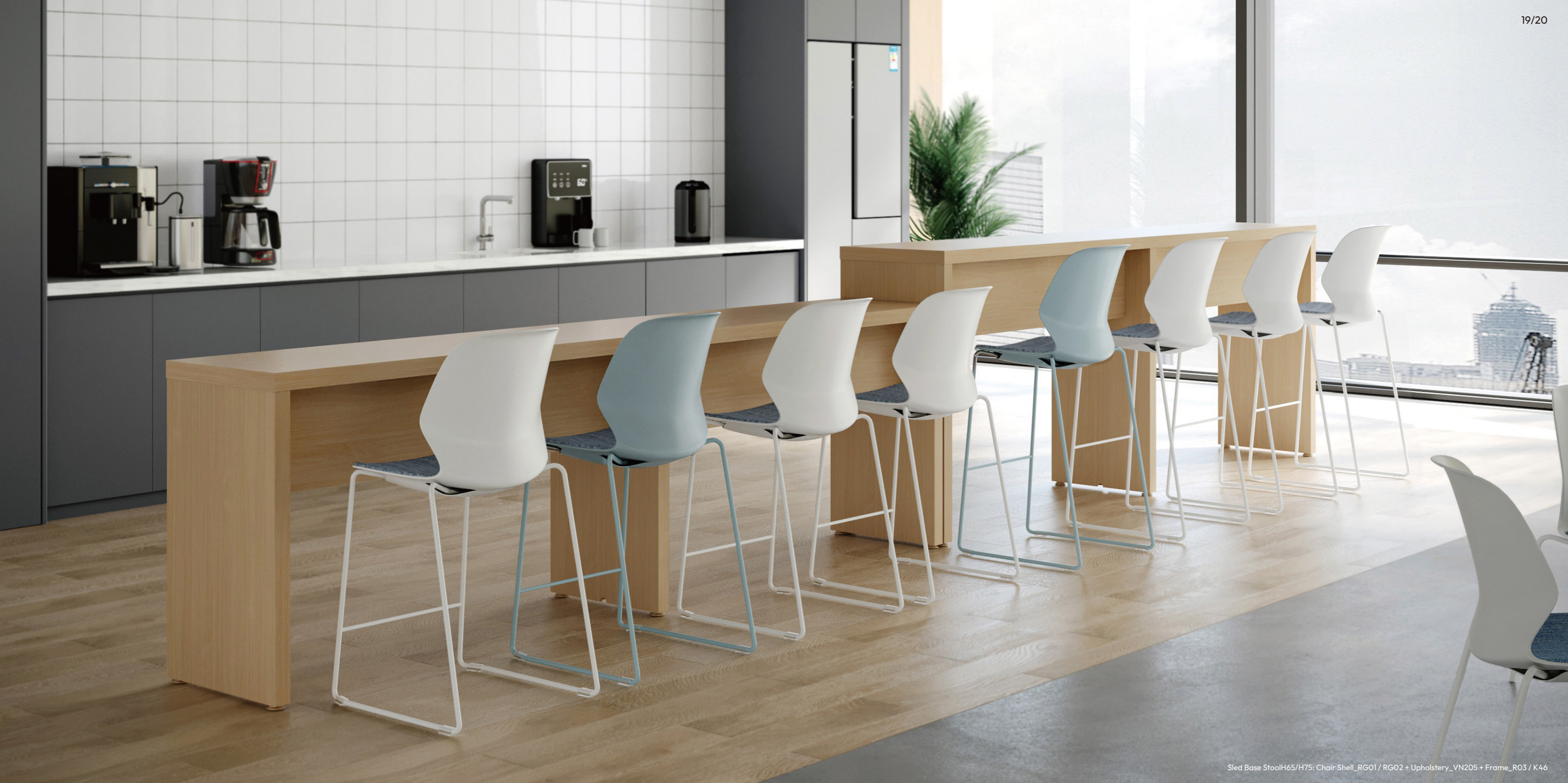
Sled Base StoolH65/H75: Chair Shell_RG01 / RG02 + Upholstery_VN205 + Frame_R03 / K46