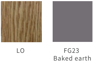
Table material: Multilayer Tabletop veneer: LO Wood grain color fireproof board Partition plate: FG23 Baked earth